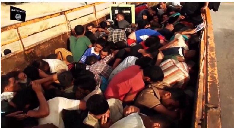
A video reportedly produced by IS shows Iraqi prisoners, including what appear to be children, piled onto trucks before being driven off for execution.